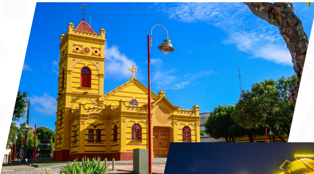
Our Lady of Mount Carmel Church

Where the city began, in the 1830s, when it was just a farm on the banks of the Rio Branco. There you will find the Igreja Matriz Nossa Senhora do Carmo, the Restaurante Meu Cantinho (former headquarters of Fazenda Boa Vista, which gave rise to the city) and the Intendência building (a replica of the first "city hall"). The Monument to the Pioneers and Praça Barreto Leite complement the historic complex.