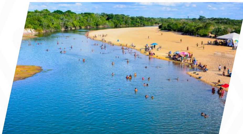
Aerial view of Praia da Polar

Praia da Polar is on the banks of the Cauamé River. It is in a more closed forest area where the river is narrower. When the river is high the beach practically disappears. It is 7 km from the center.