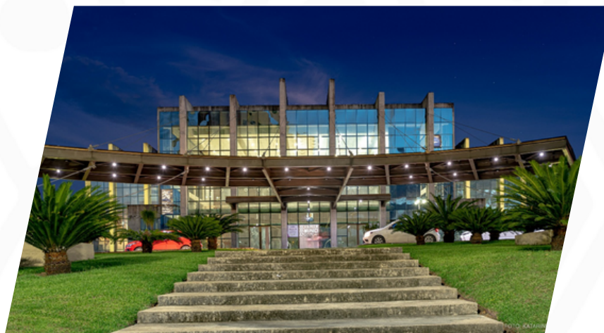
Boa Vista Municipal Theater

Considered one of the largest in Brazil, it has modern architecture, with a foyer, a main performance room (Roraimeira), with capacity for 1,100 people and a room for smaller events, the Teatro Escola, with 166 seats. Furthermore, the space has a solar energy system, with 2,880 photovoltaic panels in the parking lot. There you can still have a drink, there is a refined café located inside the Theater.