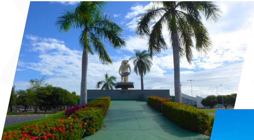
Monument to the Garimpeiro

The Civic Center Square is in an open space and has some cultural spots that are worth a visit, such as the Garimpeiro Monument, the Christ the Redeemer Cathedral and the Nenê Macaggi Palace of Culture.