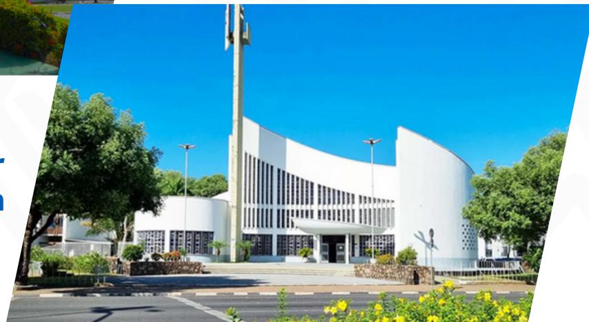
Christ the Redeemer Cathedral Church