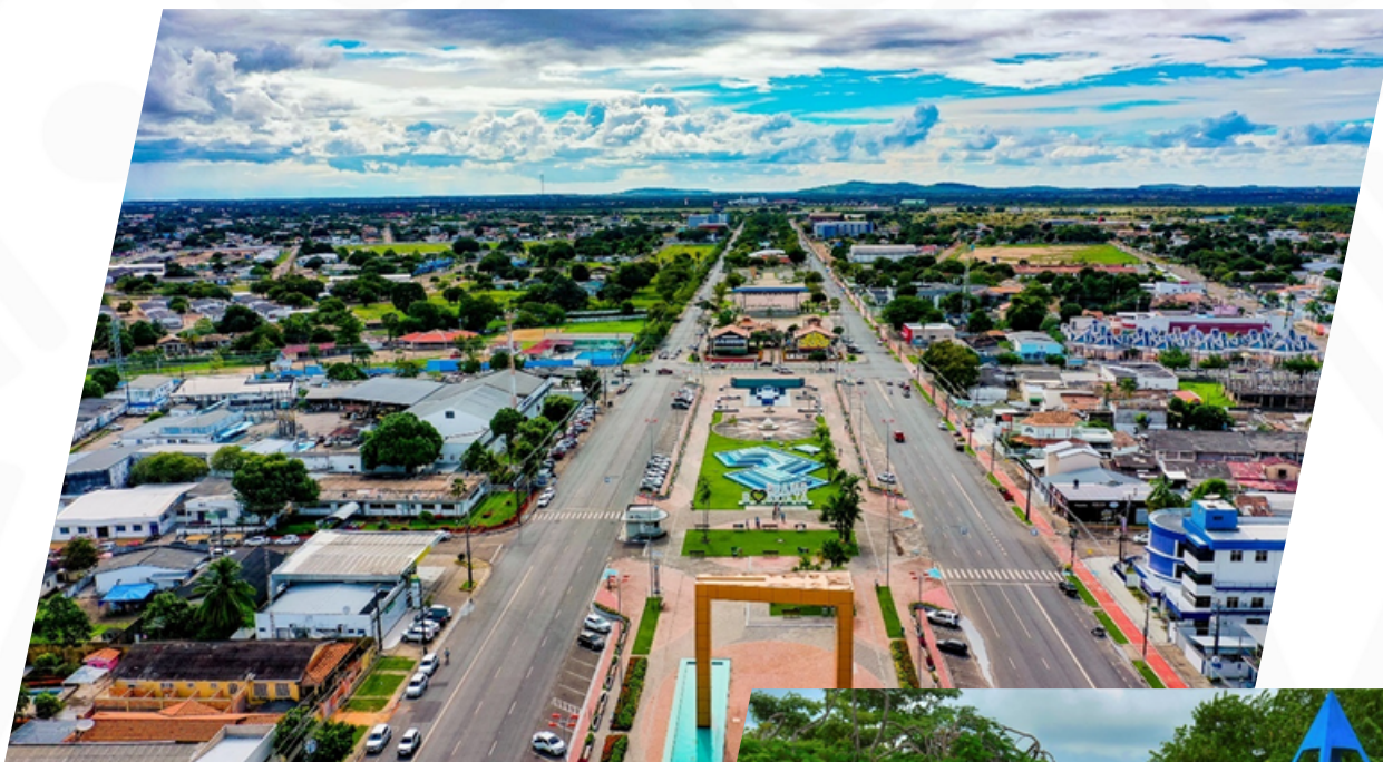
Aerial image of the complex overlooking Praça das Águas and the Millennium Portal

The complex houses Praça das Águas and the Millennium Portal, Praça do Picote, Praça Velia Coutinho, Praça Fábio Paracat and Praça da Pirâmide. In other words: there is no shortage of fun, leisure and entertainment!