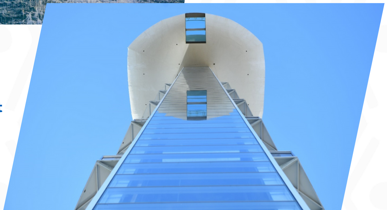
Edileuza Loz Lookout